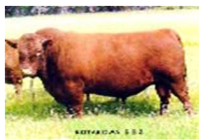
ROTOKAWA 982 NZ